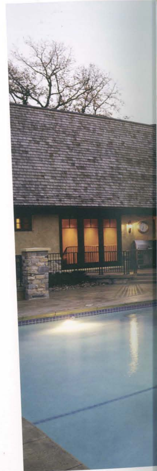
Facing Page: The lake side of the home features a pool, spa and plenty of space to entertain. Builder: Streeter & Associates.