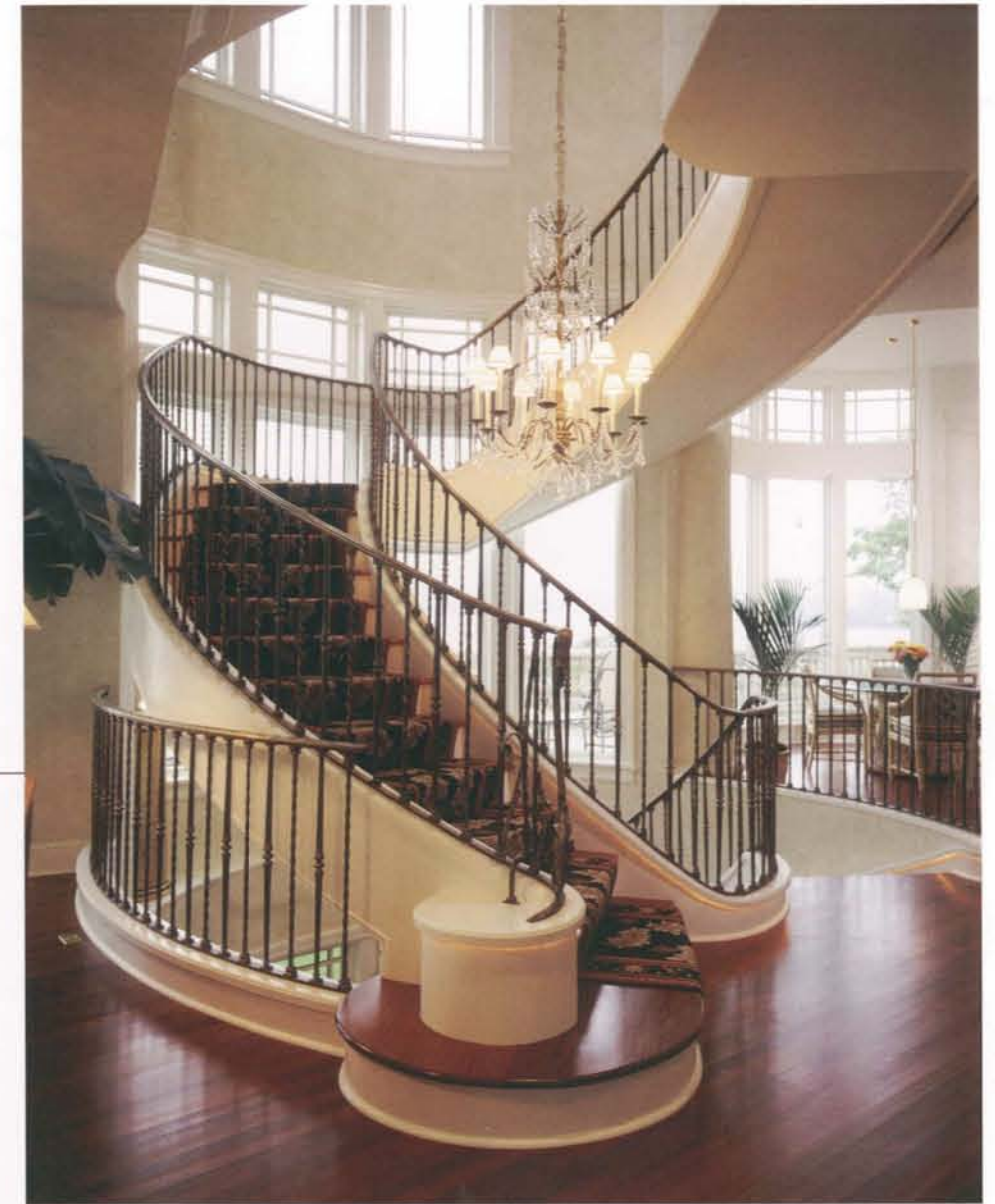
Above: Floating between the main floor and the upper level, this bronze-railed staircase encircling the gilded wood and raw crystal chandelier is hand-rubbed for an elegant patina.