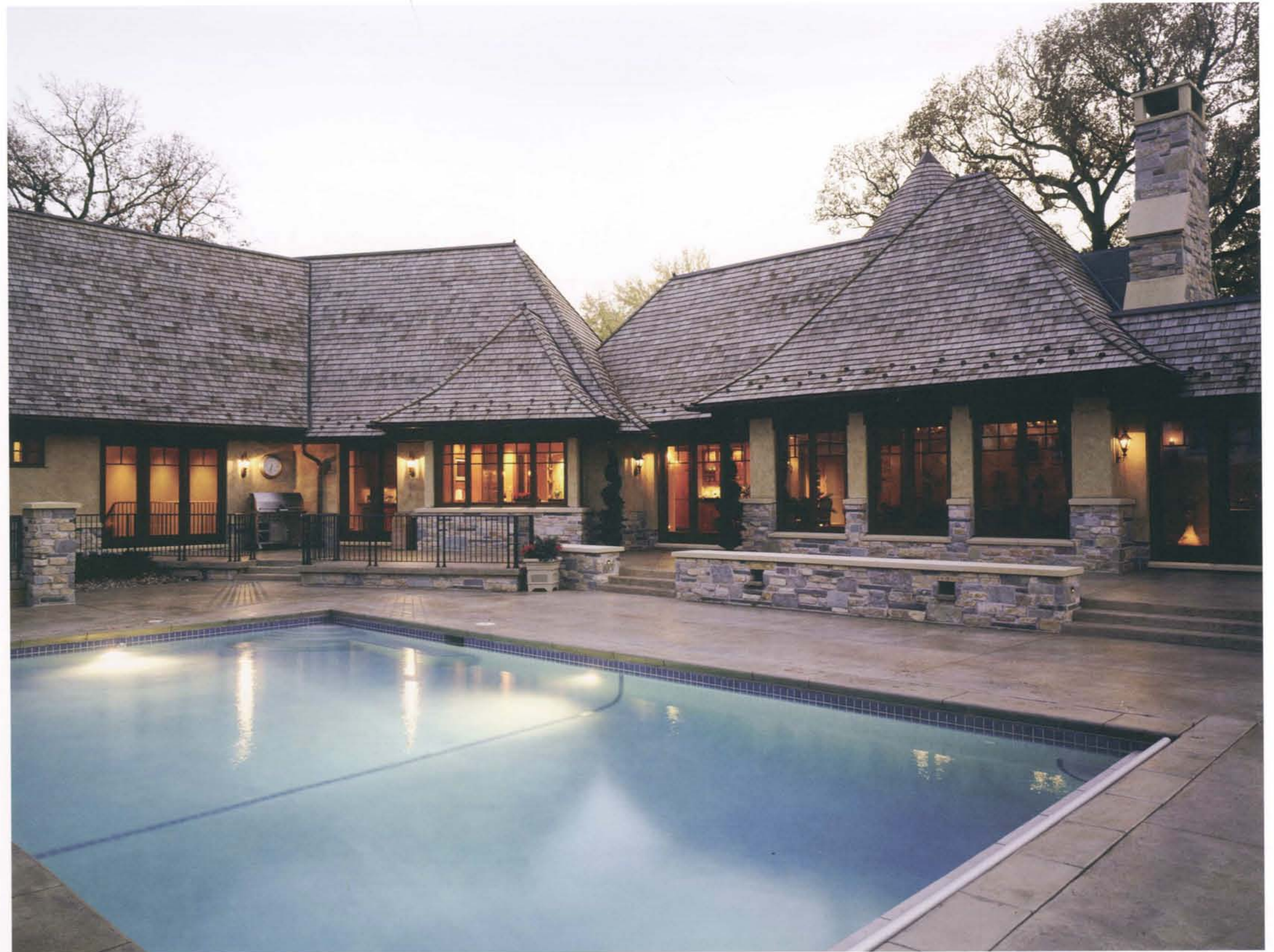
The lake side of the home features a pool, spa and plenty of space to relax. Builder: Streeter & Associates.