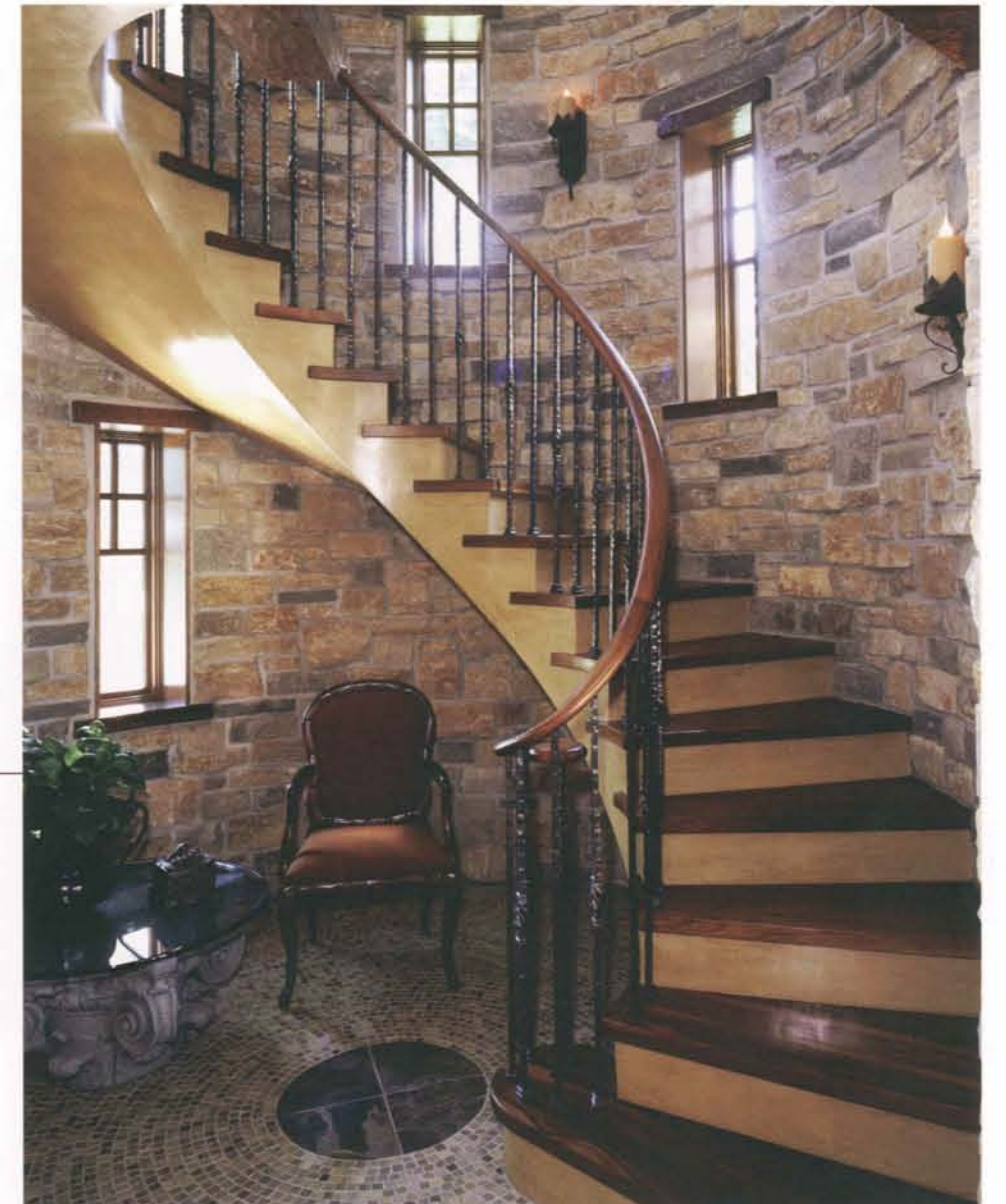
Above: Located off the main entrance, the staircase leads to a play loft for the residents' grandchildren.